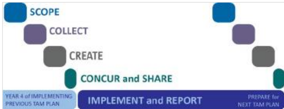
Figure 2. Phasing of TAM Plan Creation and Related Processes