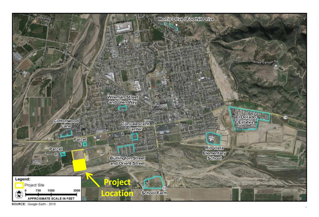
Figure 1, Location Map